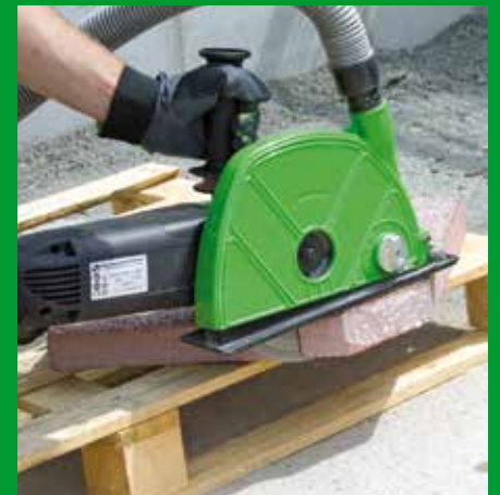
Cutting of terrace slabs