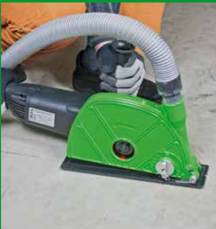
Slit of expansion joints