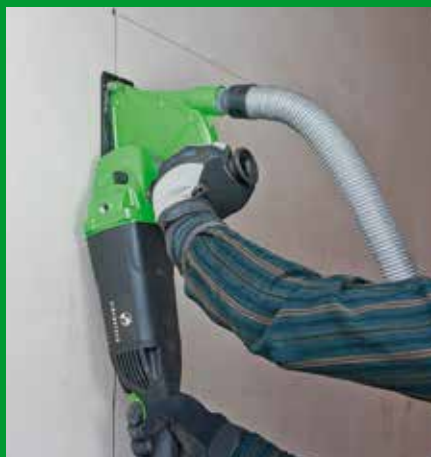
Breakthroughs into brickwork