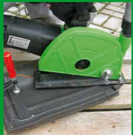
Cutting of roof tiles