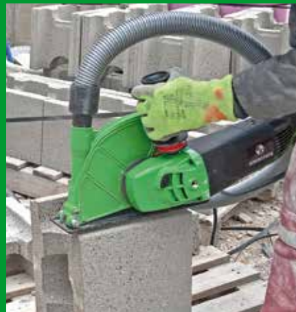
Slit of expansion joints