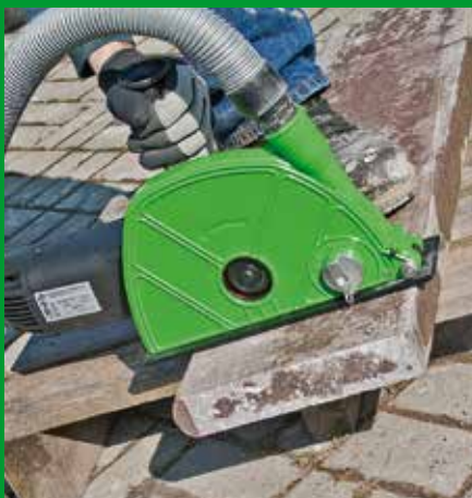
Cutting of concrete curbs

Examples of use are the cutting of roof tiles, slabs and panels, breakthroughs in brickwork, slits in expansion joints and the cutting of heavy concrete blocks . The tool is therefore suitable for a broad spectrum of uses in gardening and landscaping, building construction and civil engineering as well as, for example, roofers.